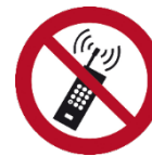
Mobile phones prohibited