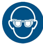
Wear safety goggles