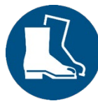
Wear safety shoes