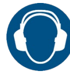
Wear ear protection