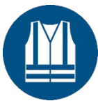
Wear safety waistcoat